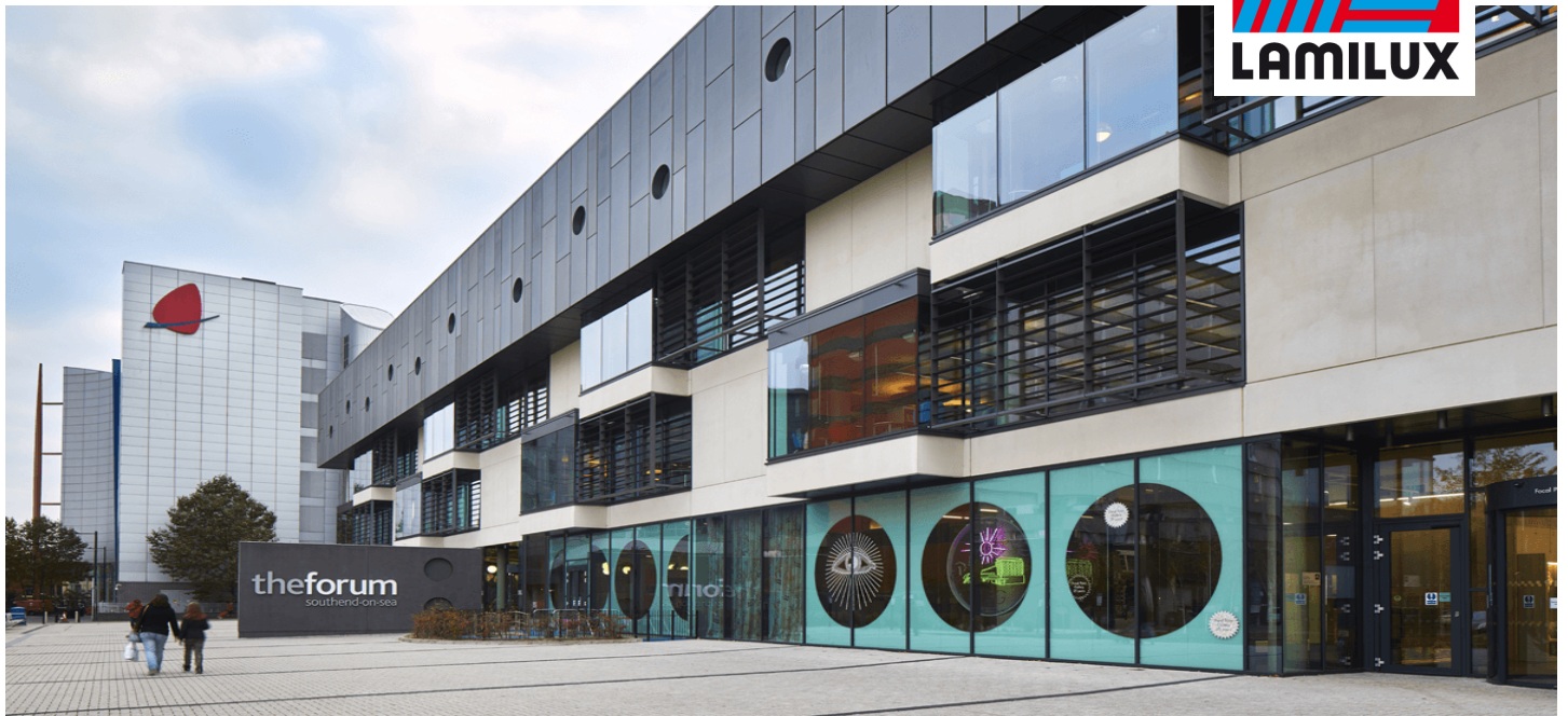
The Forum, Southend on Sea, England