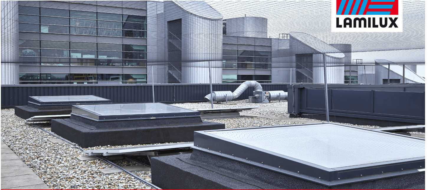
The Forum, Southend on Sea, England